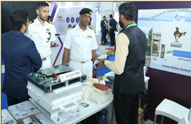
ITI Limited Participates in Aviation Exhibition held during Aero India Show 2023 at Yelahanka, Bengaluru